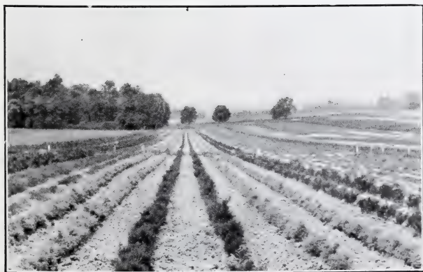
Note the "mile-long" rows of Retinosporas .

10 100 2 1/4-in. pots. .... $12.00 $100.00 8 to 12 in. .... 25.00 200.00 1 to 1 1/2 ft. B. & B. .... 50.00 400.00